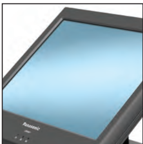
Long life LED touchscreen improves order input speed and accuracy