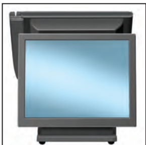
15" Interactive Order Confirmation/POP