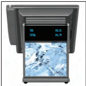
2-line Order Confirmation and static POP