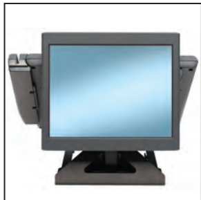
12" Interactive Order Confirmation/POP