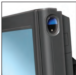
Magnetic stripe readers supports 3 tracks of data